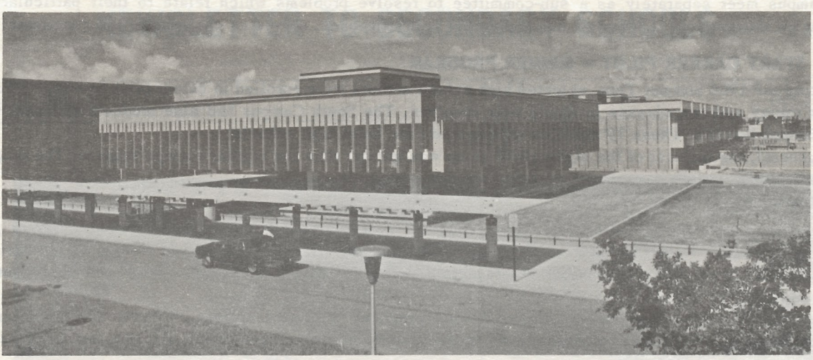
This new $2½ million Science and Technology Building was completed for opening at the beginning of the Fall Term this year at Miami-Dade Junior College's North Campus. It contains 22 laboratory-workshopdrafting room combinations, 18 adjoining classrooms, a large cylindrical teaching-conference room, and 90 offices for administrators and faculty.

During the coming year, joint committees from the instructional divisions of the college and staff members from the secondary schools will be working on arrangements for advanced placement and other benefits for able high school students. In this connection, many of you will be visiting the North Campus, and we hope to make your visits as informative and beneficial as possible. Allow me to bid you welcome to visit the campus at any time you wish.